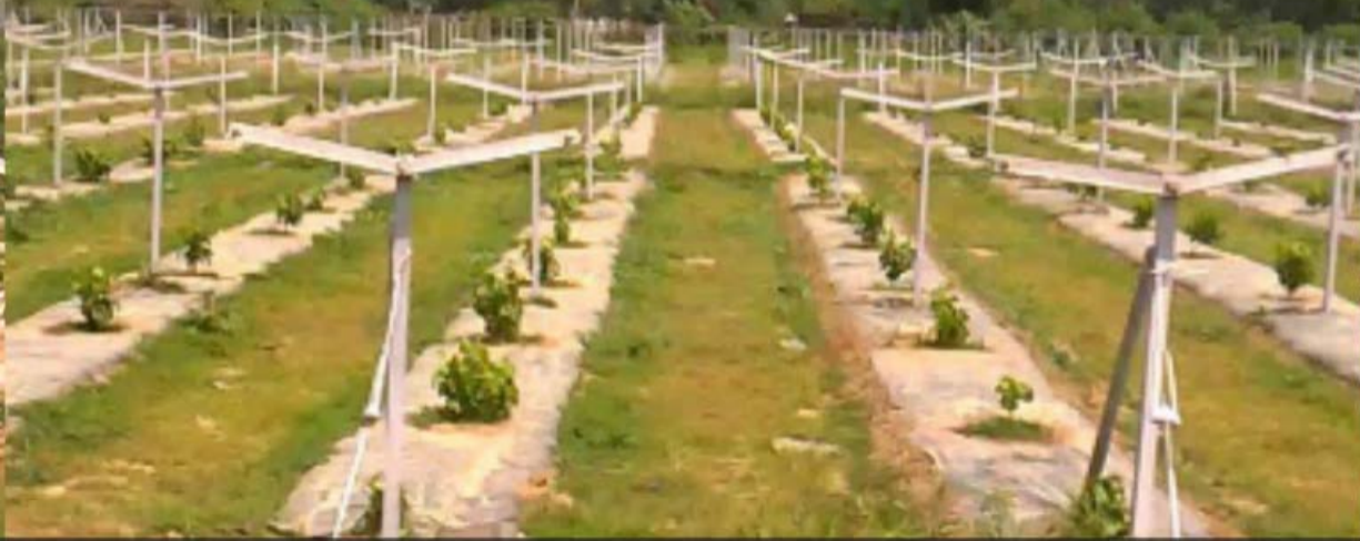
Govt. Grape farm Maralla R. S. Pura Jammu developed under MIDH 2016-17